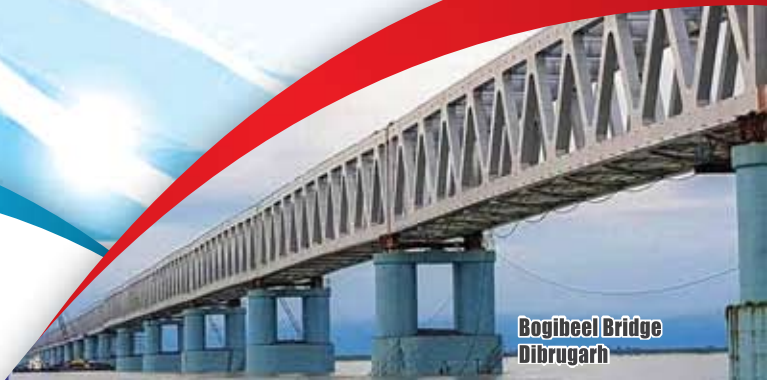
Bogibeel Bridge Dibrugarh