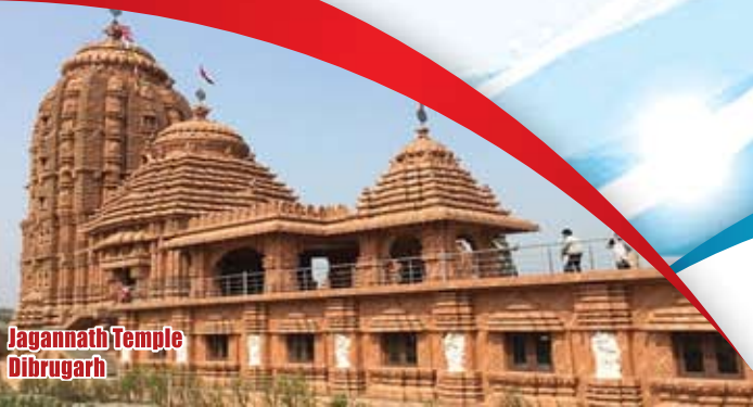
Jagannath Temple Dibrugarh

The selected full papers received within the stipulated date (31st July, 2019) will be published in seminar proceedings or an edited volume with ISBN number expected to be released in the conference.